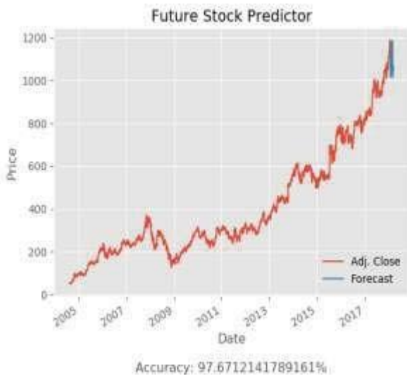
Fig. 1. Graph showing stock price of GOOGL from year 2005 till July 2018. Red is the line representing given data and blue is representing the forecasted or the predicted value of stock.

Once the model is ready, we use the model to obtain the desired results in any form we want. In our case, we shall be plotting a graph of our results (fig. 1) as per our requirements which we have discussed earlier in this paper.