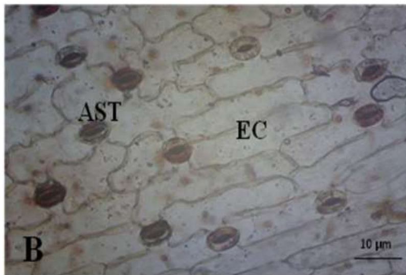
(B) Paradermal section of stomatal distribution – magnified view (AST – Anomocytic Stomata, EC – Epidermal Cells)