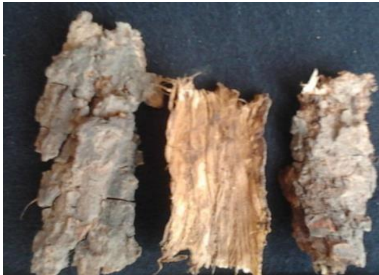
Figure:1 Dalbergia Sissoo Rox Stem Bark

Variety - External surface: dull ruddy brown; internal surface: light earthy colored Smell - Trademark woody Taste - Severe Size - 6-9 cm long, 3-4 cm in width Shape - Rectangular, marginally bended Surface - Harsh, reticulate Crack - Fibrous and adaptable