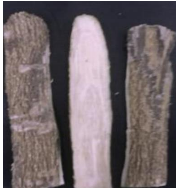
Figure: 2 Stem Bark of Citrus limon Linn.