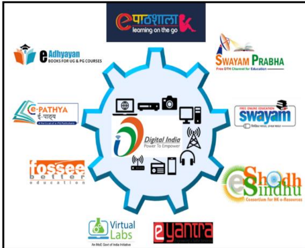
Figure 2: Initiatives of government for Digital India

Additional efforts to access electronic books and journals have begun. The e-PG Pathshala platform, run by MHRD-UGC, offers 700+ e-books (e-Adhyayan), online courses (UGC-MOOCs), and offline access (e-Pathya). The IGNOU provided online courses like eGyanKosh and the virtual classrooms Gyandarshan and Gyan Dhara. Gyan Dhara is an online audio counselling service ( http://gd.ignouonline.ac.in/gyandhara/ ), Gyandarshan is committed to meeting the educational and developmental requirements of society, and eGyanKosh is used to store, preserve, and exchange digital learning materials ( http://egyankosh.ac.in ). The National Digital Library of India (NDL) project's goal is to provide a single-window search facility with a virtual facility framework for studying e-content ( https://www.ndl.gov.in ). The Shodhganga offers research students a venue to deposit their doctoral theses and make them open access to the whole academic community. ( https://shodhganga.inflibnet.ac.in/ ). The website e-ShodhSindhu ( https://ess.inflibnet.ac.in/ ) also offers access to electronic material.