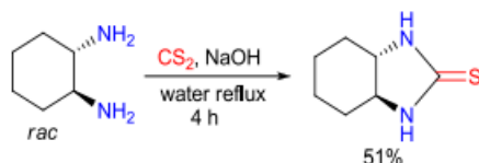
Scheme 3. Synthesis of a chiral, racemic thiourea from diamine and CS 2