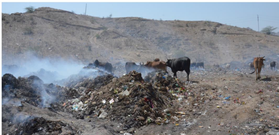
Figure: 4.1 - Smoke rising from the garbage