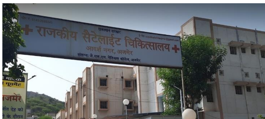
Government Satellite Hospital