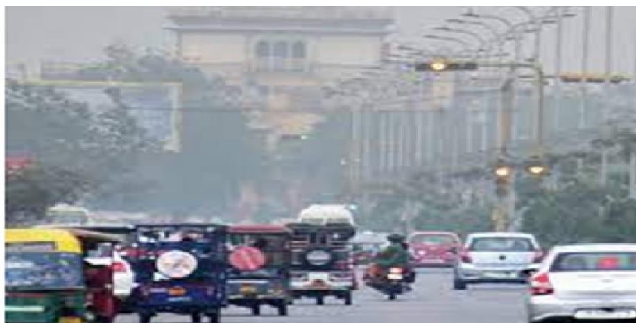
Figure: 4.2 - Smoke rising from the Vehicle at railway station road

The effects of pollution are beginning to be seen widely in the world. While pollution is harming the natural environment, its effect is harming humans and animals as well as various types of flora. Pollution is mainly divided into three categories - Water pollution, noise pollution and air pollution. All these pollutions have harmful effects on the environment in different ways. In the present research, the effect of air pollution on human health has been studied.