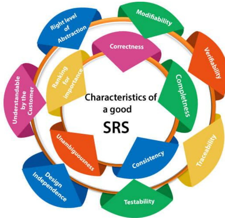
Figure: 1. Characteristics of good SRS.