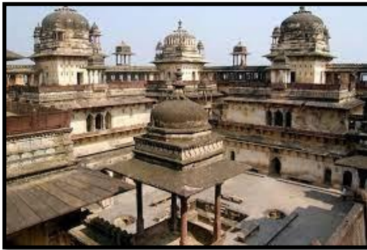
Figure: 2 Bundelkhand Tourism

Datia is famed for its architecture and palaces erected by Bundelas, particularly those of Virsinghdeo. Some of them are unique. Datia also boasts a famous `Saktipeeth` which attracts a lot of people for religious worship. It also contains a notable Jain Temple. Datia has always aimed for preserving the indigenous Bundela culture, its language and traditions. At today, there are various theater and literacy groups in Datia, who are working to conserve and disseminate its cultural history. Panna, too, has a strong cultural base. The great Bundela chief, Chhatrashal, had made Panna his capital. District Chhatarpur is named after him. Panna, is renowned as `town of temples`. There is a fabled narrative claiming that Saint Prabhunath told to his pupil, Chhatrashal that on one specific night whatever area will be covered by him sitting on the back of his horse, will find the mine of diamond beneath the earth. So are the diamond mines in Panna. As a respect to Saint Prabhunath, Chhatrashal created numerous temples, mostly credited to Lord Shiva. It is estimated that there are as many as eleven hundred old temples in the neighborhood. Khajuraho, the prominent tourist site in India, is situated in the district of Chhatarpur. Khajuraho is home to many temples with passionate sexual scenes carved into stone on the outer walls. They were created by the Chandelas rulers who ruled Bundelkhand before Bundelkhand was founded in the area.