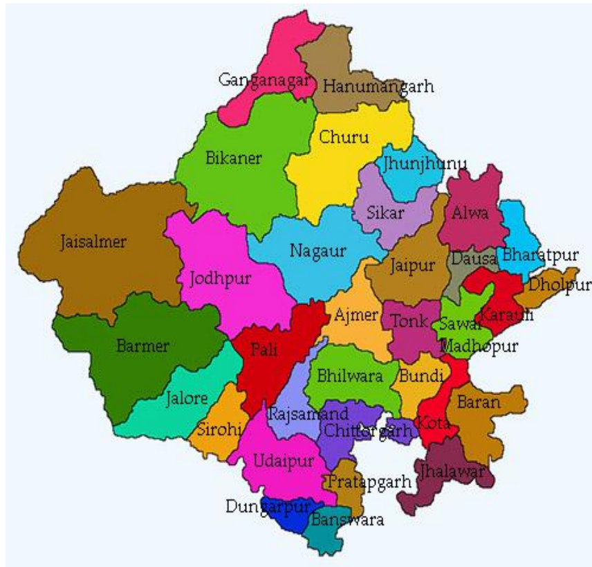
Figure 1: Location map of Rajasthan and district Banswara